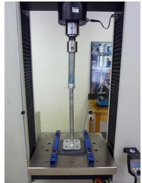
FIG.2 TEST SETUP

Test data for each screw jack is provided in the following table: