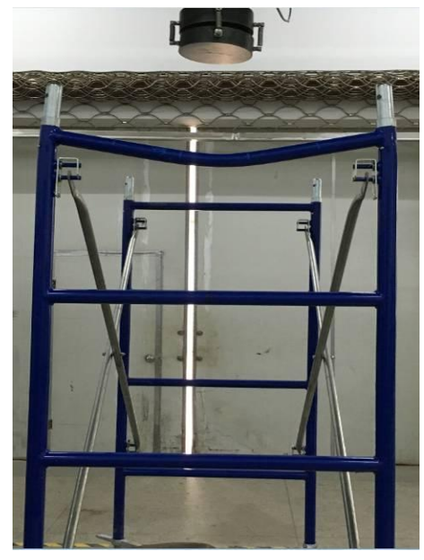
Sample 4-2 before test