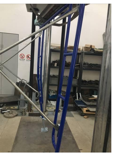
Sample7-1 before test