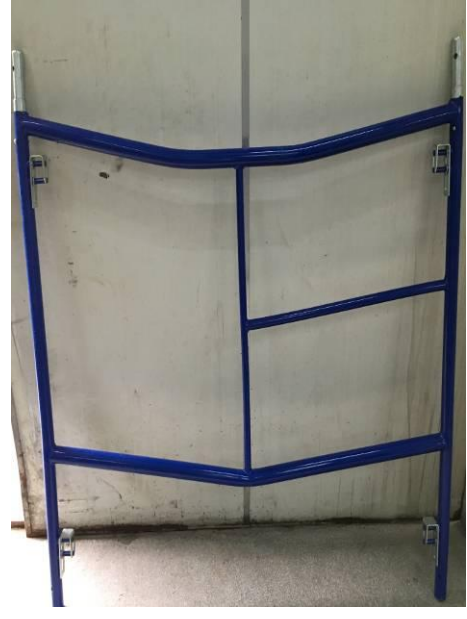
Sample 12-2 before test