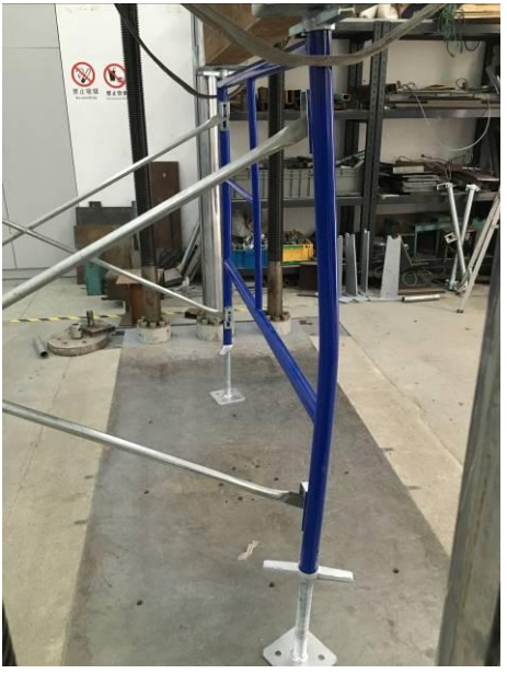
Sample 12-1 before test