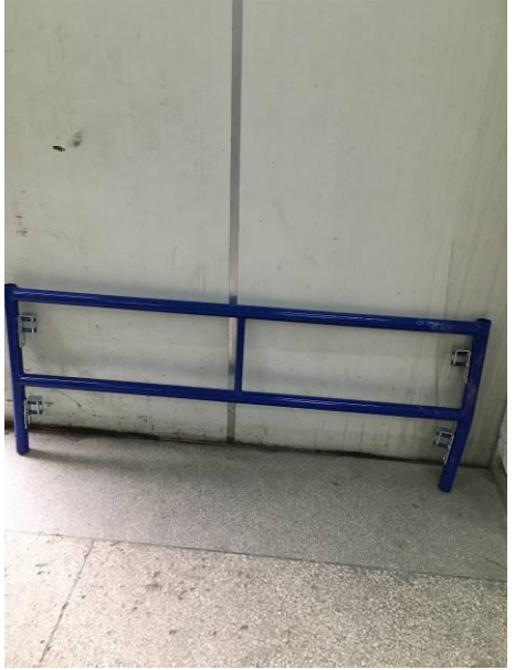
Sample 14-1 before test