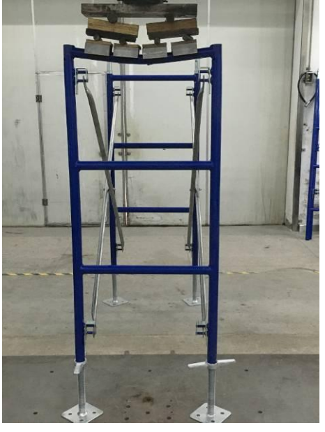
Sample 2-2 before test