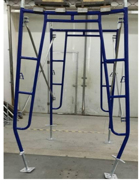
Sample 9-2 before test