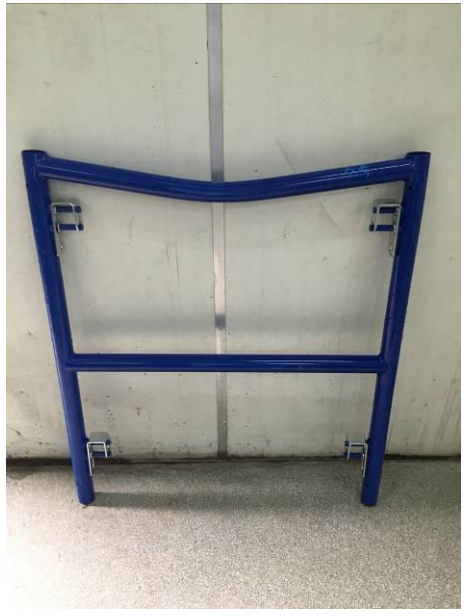
Sample 6-2 before test