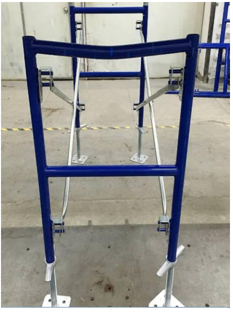
Sample 3-2 before test