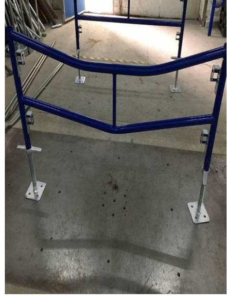
Sample 14-2 before test