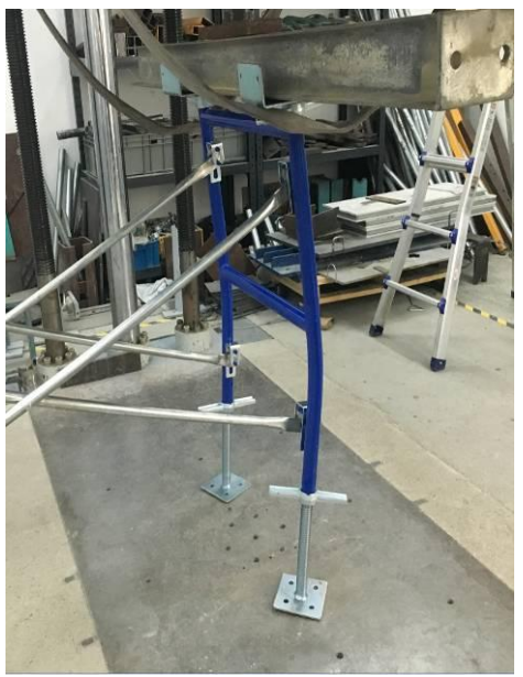
Sample 6-1 before test