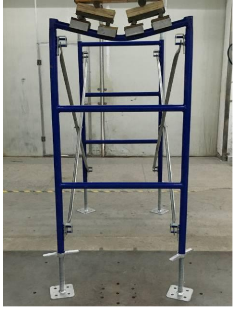
Sample 5-2 before test