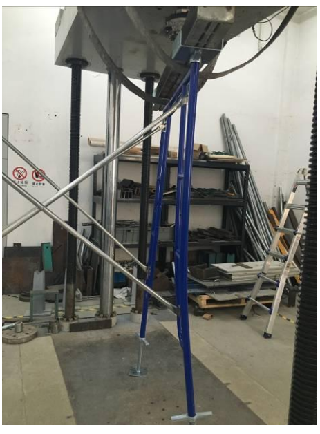
Sample 9-1 before test