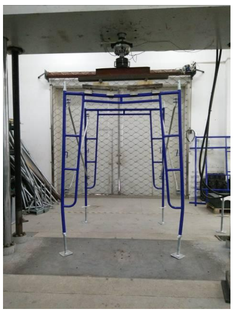
Sample 7-2 before test