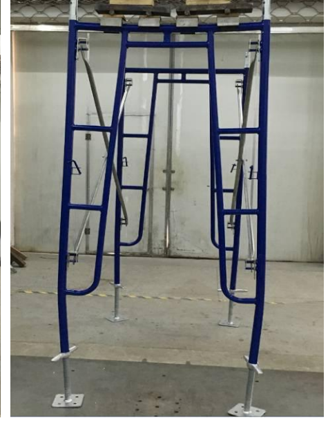
Sample 8-2 before test