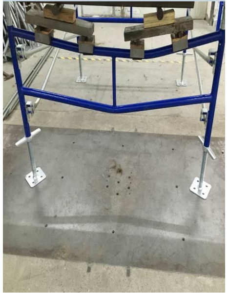
Sample 13-2 before test