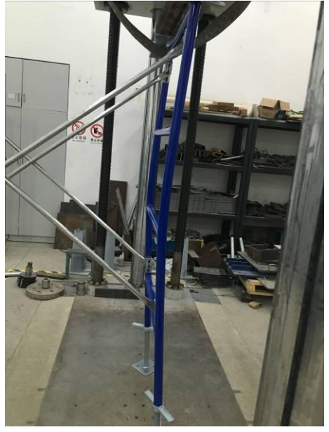
Sample 4-1 before test