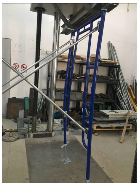
Sample 8-1 before test