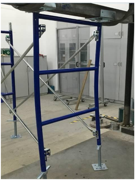
Sample 5-1 before test