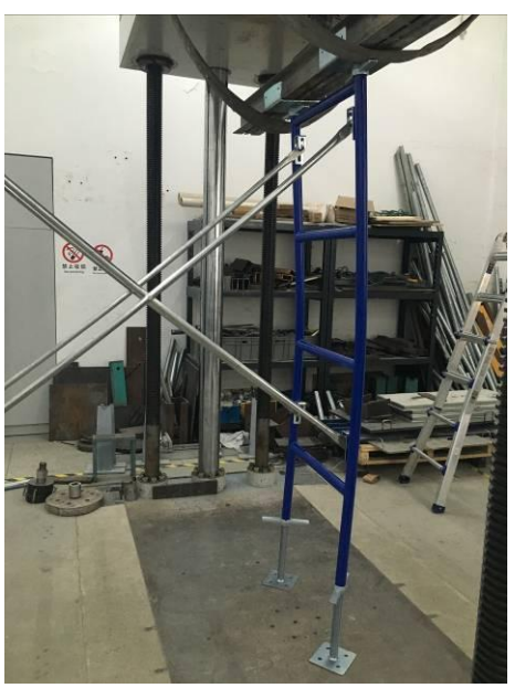
Sample 1-1 before test