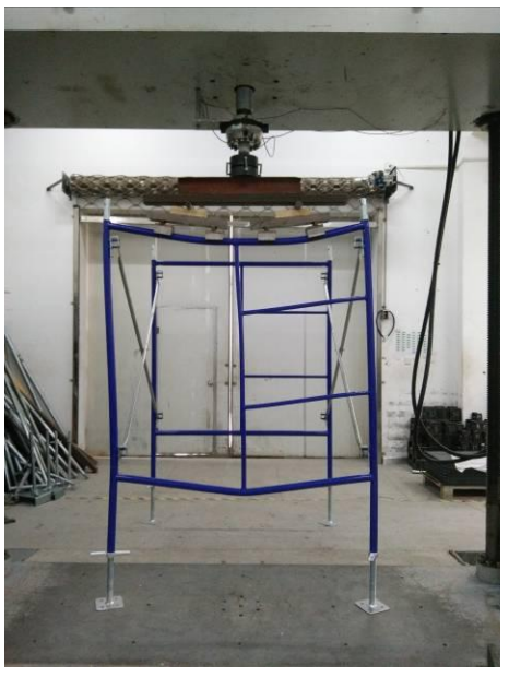
Sample 10-2 before test