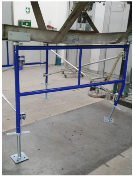
Sample 13-1 before test