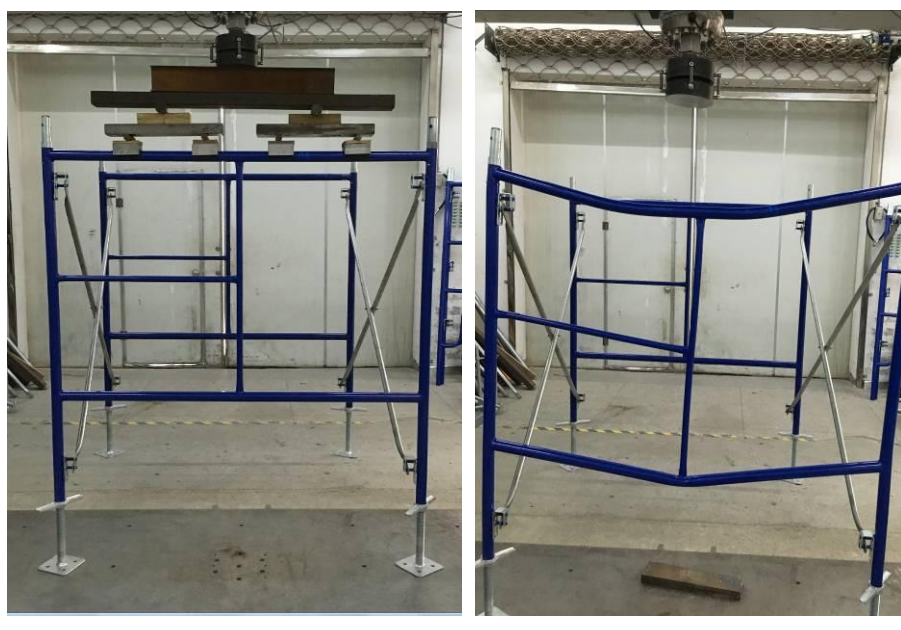
Sample 11-2 before test