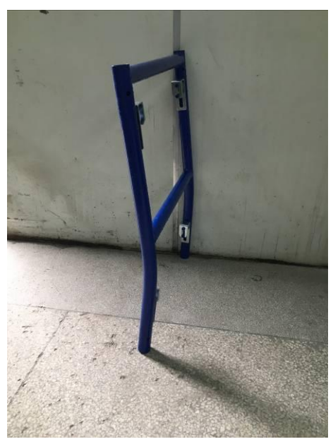
Sample 3-1 before test