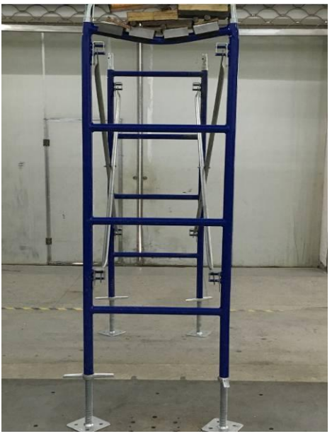
Sample 1-2 before test