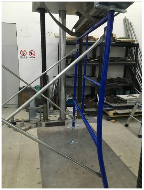
Sample 11-1 before test