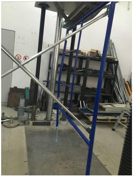
Sample 10-1 before test